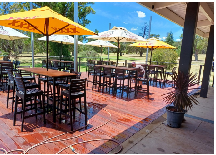
The new deck - all ready for the Sapphire Cup